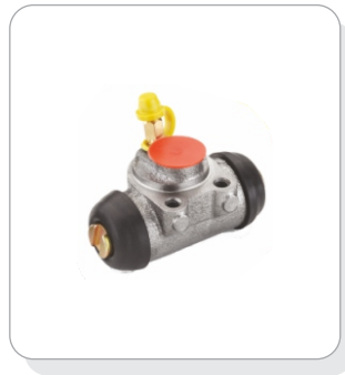
Wheel Cylinder (Rear)