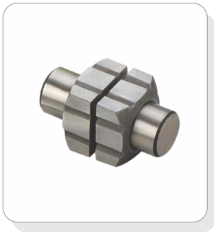
Slider Block Set