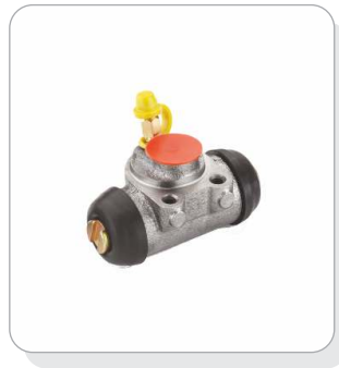
Wheel Cylinder (Rear)