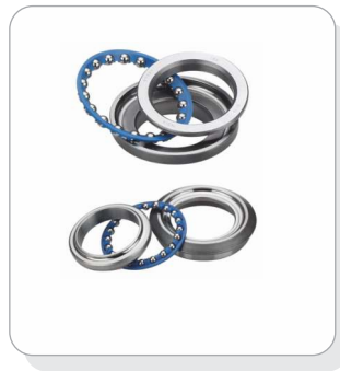
Steering Cone Set